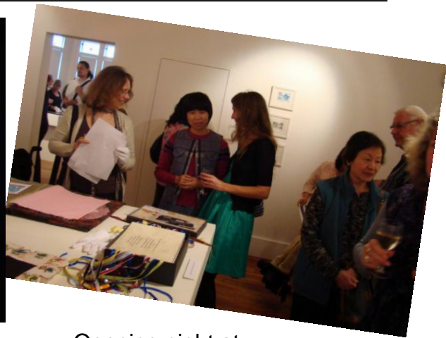
Opening night at the exhibition.